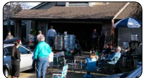
3 o'clock, most of the brewing is done and the party will begin to rock!

HAZE is dedicated to fostering social and educational opportunities for homebrewers in the foothills.